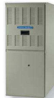
Silver SI American Standard 80