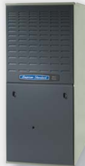
Silver XI Single-Stage

High end comfort, efficiency and durability, all at a value. The Silver Series provides your home with just that. Plus, every model in this series comes with the American Standard commitment to quality you expect.