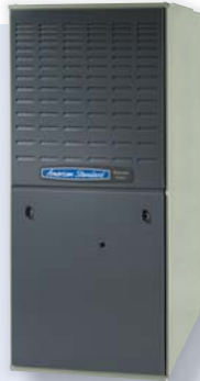
Platinum SV Variable-Speed, Communicating

It's called the Platinum Series for a reason. With AccuLink™ capability, continuous Comfort-R™ mode and an array of other innovative features, this Series gives your home both a high level of comfort and a high level of efficiency.