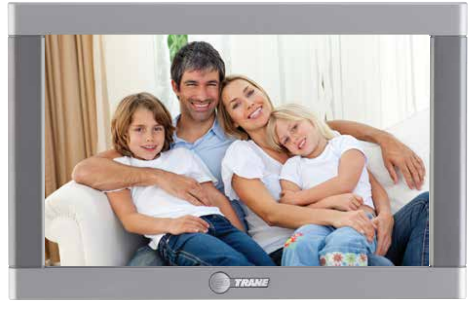
The Trane ComfortLink<sup>™</sup> II Control integrates home comfort into your personal lifestyle like nothing you've ever seen before.