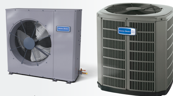
Silver 16 Low Profile