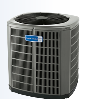
AccuComfort™ Platinum 18