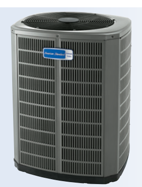
AccuComfort™ Platinum 20

American Standard Platinum air conditioners offer our highest combination of performance, efficiency, and temperature control. Built with American Standard's commitment to quality throughout, the Platinum line offers advanced energy-saving features like Duration<sup>™</sup> variable speed compressors and Spine Fin<sup>™</sup> coils.