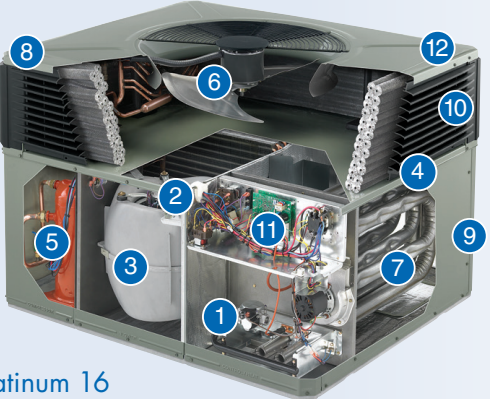
Platinum 16 Gas/Electric System