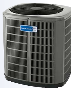
AccuComfort™ Platinum 18