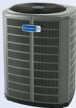
AccuComfort™ Platinum 20

American Standard Platinum air conditioners offer our highest combination of performance, efficiency, and temperature control. Built with American Standard's commitment to quality throughout, the Platinum line offers advanced energy-saving features like Duration™ variable speed compressors and Spine Fin™ coils.